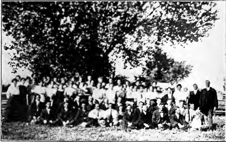
THE FIRST THREE-DAY CLASS IN LEADERSHIP

7. Methods of Teaching. —Four periods per week. Text—, Practice teaching will be based on the lessons of the "Y. M. M. I. A. Manuals" and "Young Woman's Journal." Lectures on methods of teaching will be given. Most of the course will be taken up, however, in actual presentation of "Manual" and "Journal" lessons, by students.